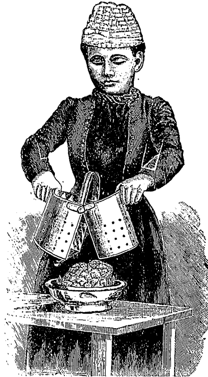
FIG. 3. Showing Vegetables being Transferred Whole into the Dish.

side the saucepan. After the vegetables are sufficiently boiled, the saucepan is taken from the fire and the strainer is then lifted out, allowing the water to drain away, as shown in Fig. 2, then the vegetables are placed into the dish, as shown in Fig. 3, by simply loosening the pin in the